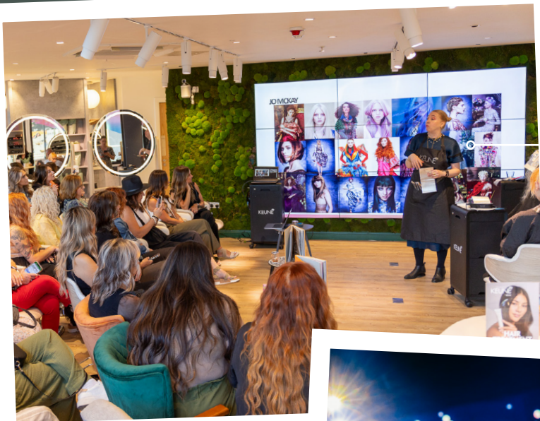
LONDON 2023 KLC Reward Trip