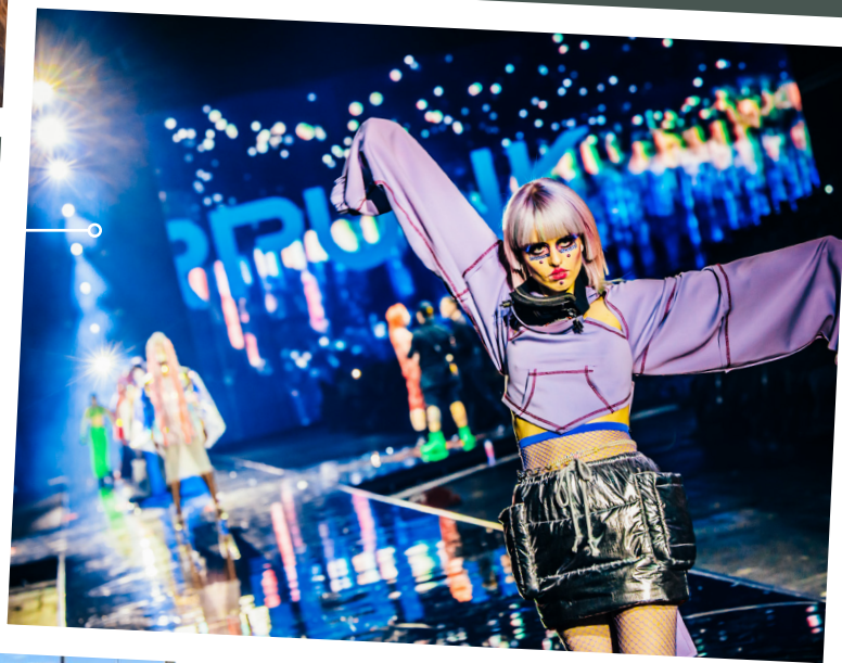
AMSTERDAM 2022 KLC Reward Trip